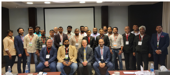
FCIA Doha Symposium Attendees.