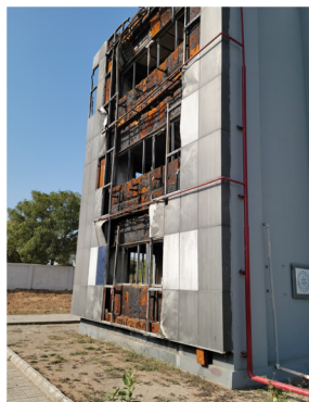
IIT-G Exterior Wall Fire Test, simulated Grenfell Tower Fire.